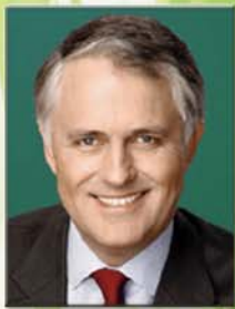
Malcolm Turnbull Federal Leader