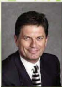
Ted Baillieu State Leader